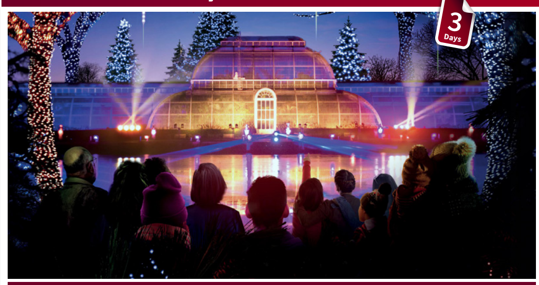
A fantastic festive theme at Kew Gardens, Windsor Castle and Hampton Court